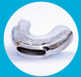
O 2 Vent™ Mono