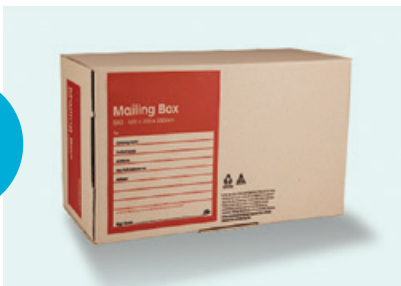
Place in suitable packaging