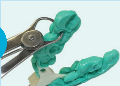
Calipers measuring the bite