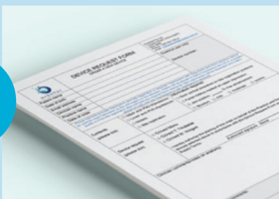
Device request form