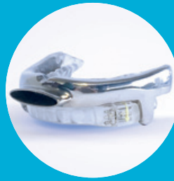
O 2 Vent™ W